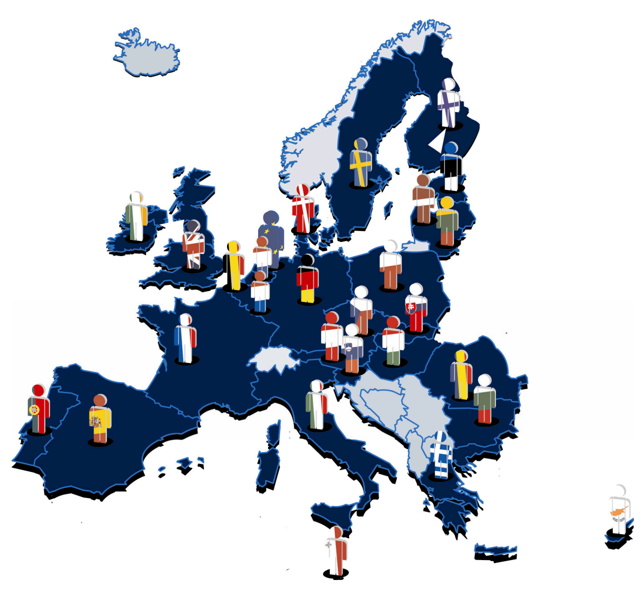
INSERT MAP: EU map containing the number of EU MS law enforcement officers and logos