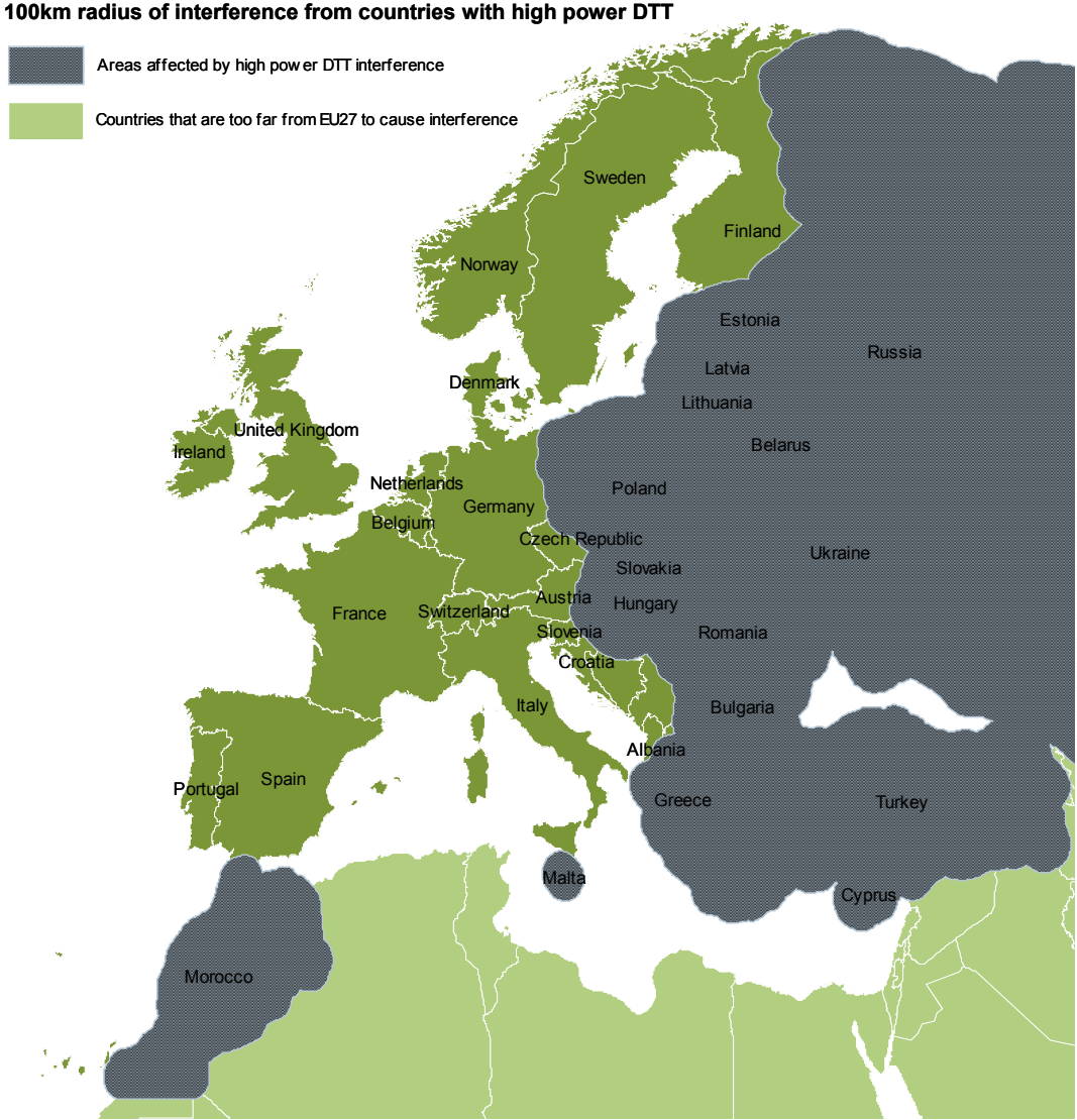
Figure: Assumption of regions in which harmful interference is caused by Member States using the 790–862MHz sub-band for high-power DTT

As shown in Figure 2.1 below, assuming cross-border propagation of up to 100km in distance, large parts of the Czech Republic, Austria and Slovenia would be unable to benefit from new services deployed in the sub-band. This illustrates the potentially negative impact of one Member State’s decision on another.