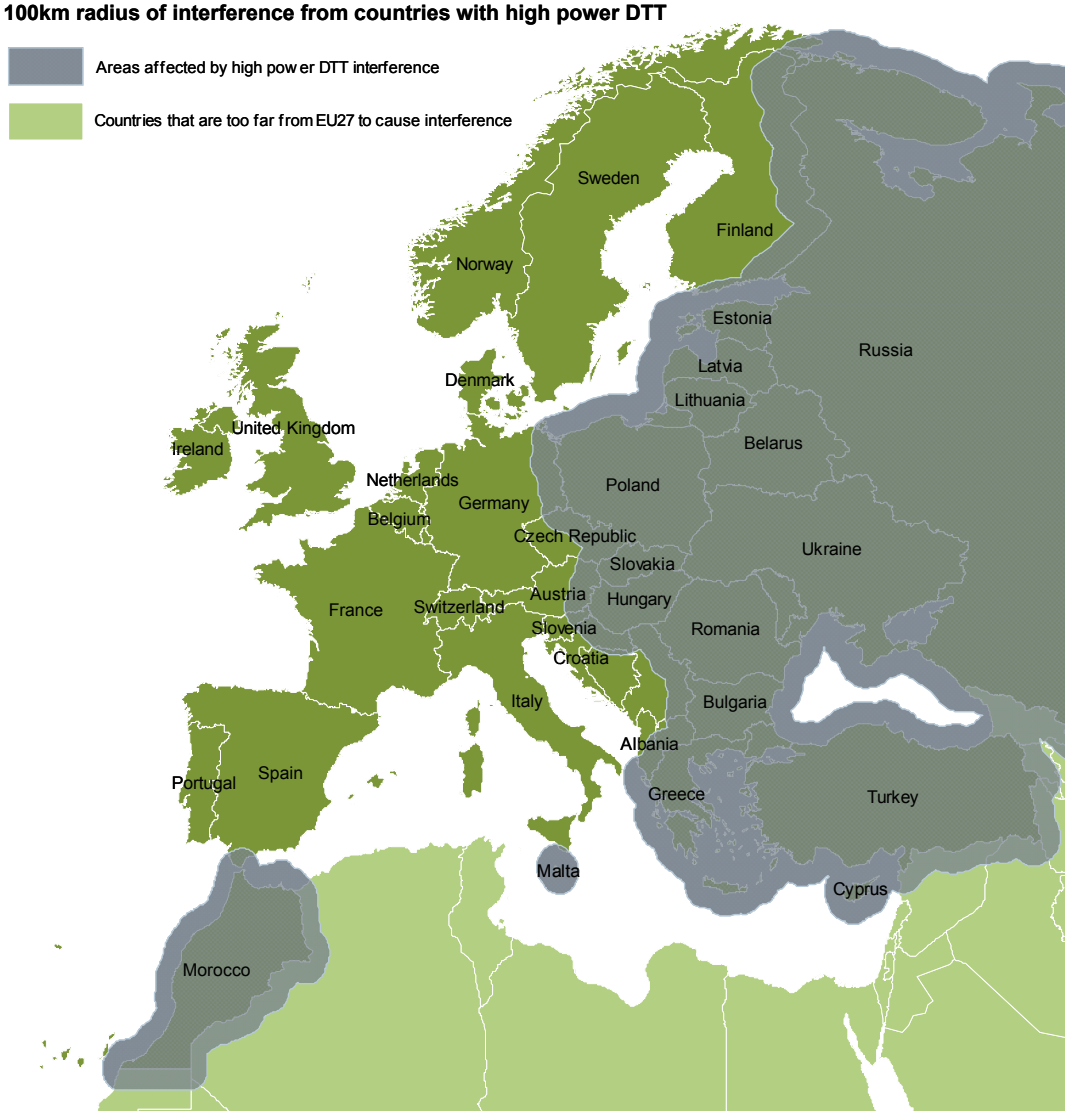
Figure: Assumption of regions in which harmful interference is caused by Member States using the 790–862MHz sub-band for high-power DTT

As shown in Figure 2.1 below, assuming cross-border propagation of up to 100km in distance, large parts of the Czech Republic, Austria and Slovenia would be unable to benefit from new services deployed in the sub-band. This illustrates the potentially negative impact of one Member State’s decision on another.